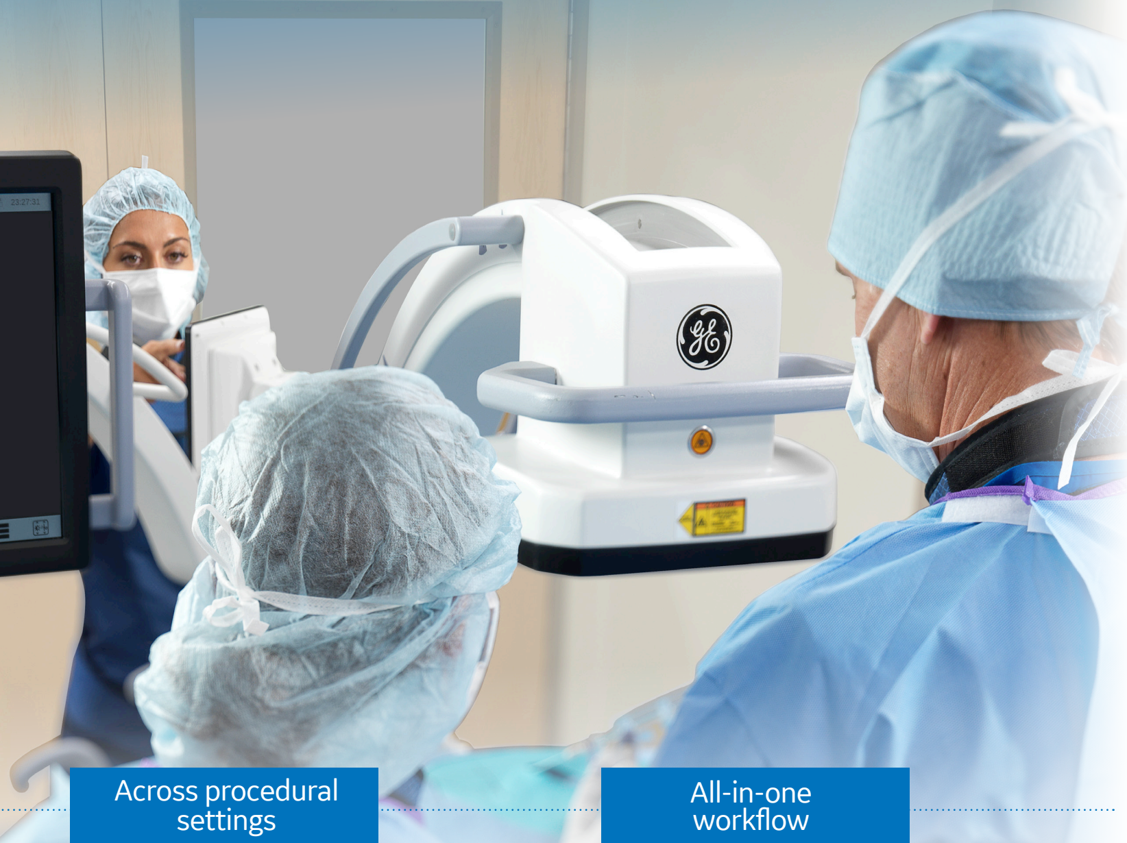
Image quality is essential across procedures and surgical settings, including in tight spaces. With OEC One CFD, enjoy the image quality expected from OEC C-arms and the clinical versatility needed in a compact, all-in-one mobile C-arm.

See more with the Clear View image chain delivering 1:1 image detail from a CMOS flat panel detector to a 4K 27" image display monitor, and with advanced imaging features like Live Zoom.