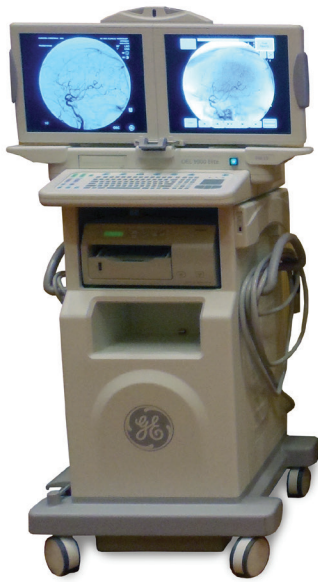
OEC 9900 Elite workstation