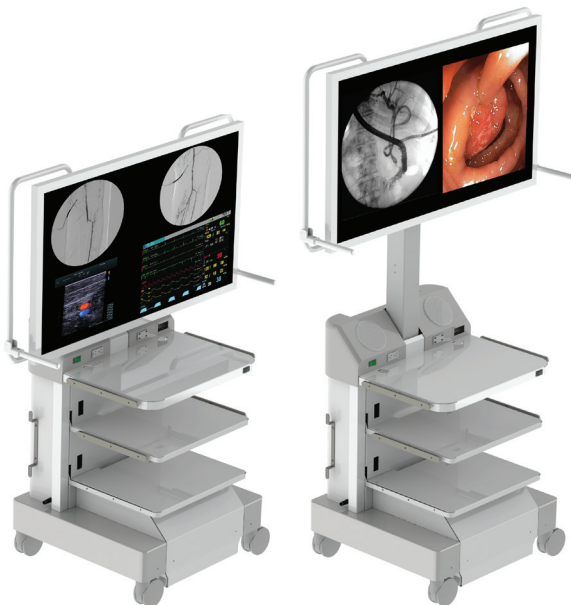
Retracted position for room transfer/storage

Combined with a C-Arm and an imaging table, the ilex 55 creates a state-of-the-art mobile diagnostic platform for vascular, cardiovascular, G.I., neuro/spine and orthopedic procedures.