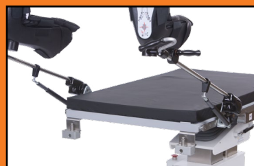
Metal-free perineal end of table: unobstructed imaging access to edge of tabletop.