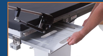
Removable radiographic cassette tray: loads from either side of table. Accepts cassette with grid cap or mobile DR detector.