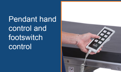
Pendant hand control and footswitch control