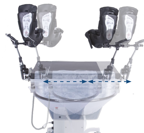
Transverse travel: \pm 3.5" , 7" total