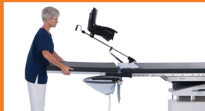
Lightweight, radiolucent tabletop extension