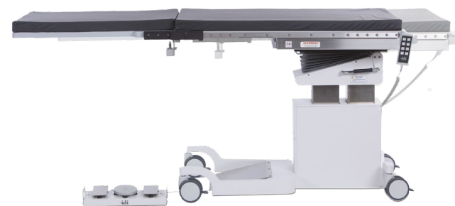
Longitudinal tabletop travel: 10"