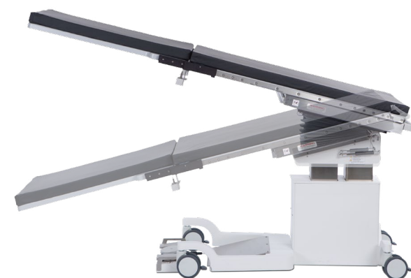
Trendelenburg: \pm 15^\circ