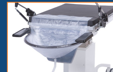
Removable, collapsible drain bag support (elbow rests are optional)