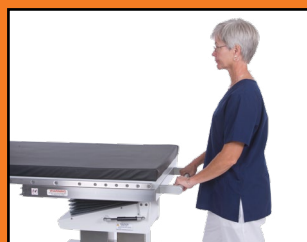
Built-in transport handle