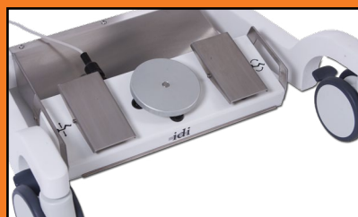
Built-in footswitch storage tray