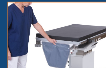
Removable lead-vinyl x-ray shield