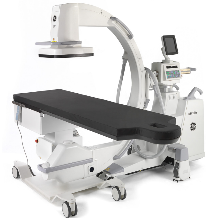
GE OEC is an official distributor of STILLE products

See our full product line at www.stille.se